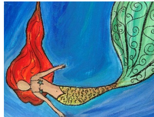
JULY 20 Mermaid