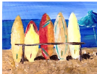
AUGUST 31 Surfboards on the Beach