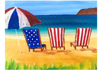
JUNE 29 Beachy Stars & Stripes