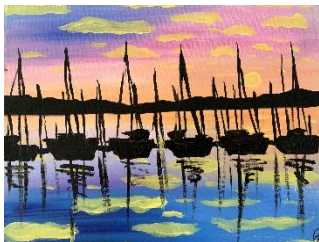
AUGUST 24 Boats in Harbor