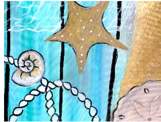
MAY 11 Nautical Sea