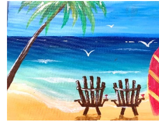
MAY 25 Sitting by the Bay