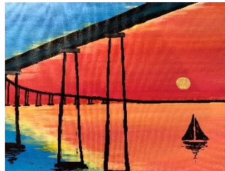
JULY 13 Coronado Bridge