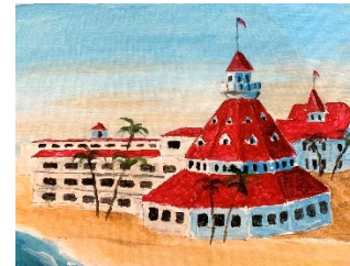
JULY 27 The Del