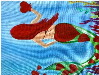
FEBRUARY 16 Sweetheart Mermaid