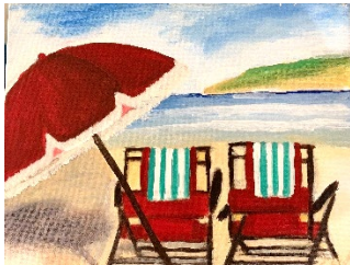
JULY 6 Days at The Del