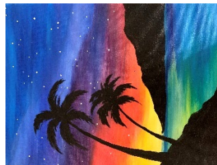
SEPTEMBER 7 Tropical Sunset