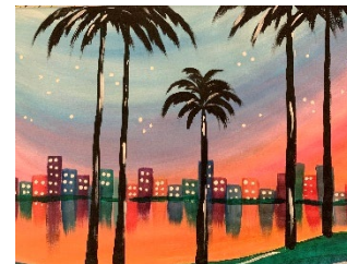
SEPTEMBER 14 San Diego Skyline