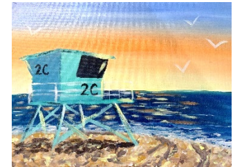
AUGUST 17 Lifeguard Stand